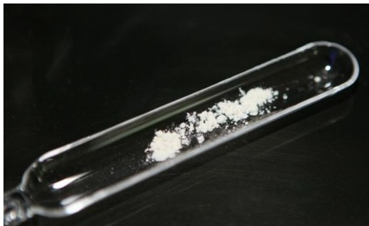
Appearance at visible light